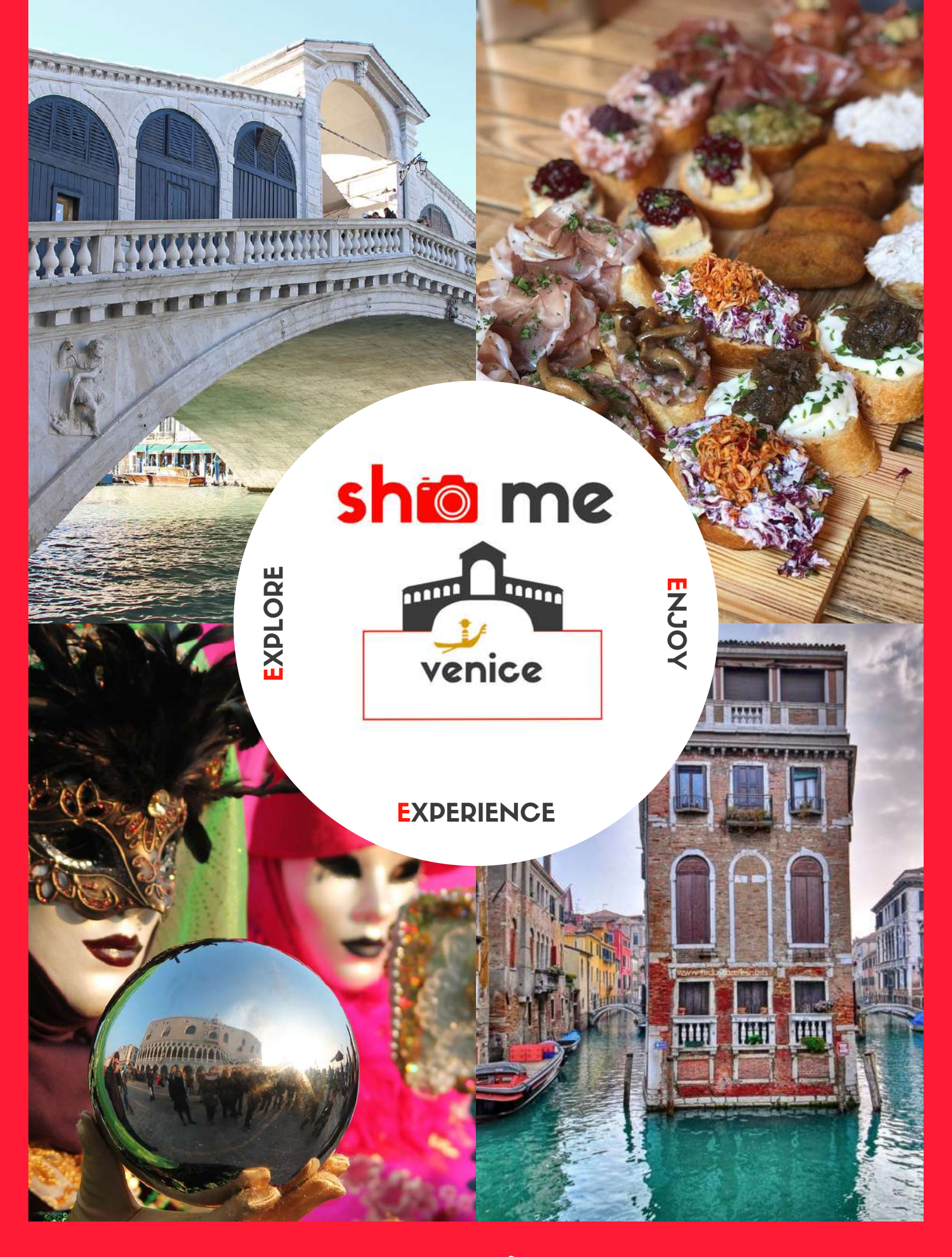
SPECIAL PRIVATE TOURS