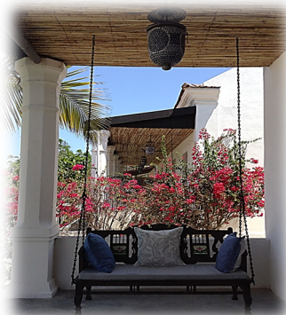
Ibo Island Lodge