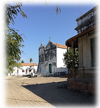
Church and Monuments