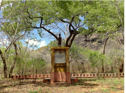
National Hero Monument