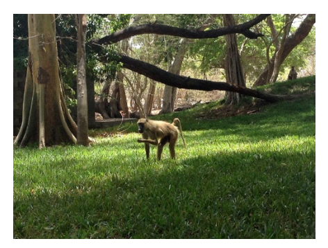
A curious baboon